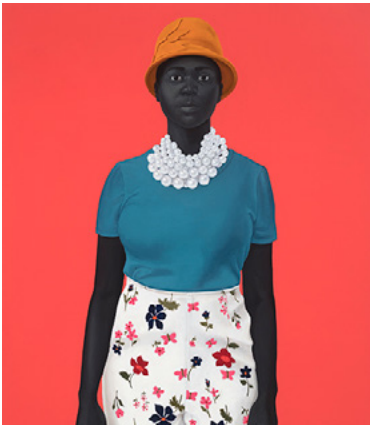
She had an inside and an outside now and suddenly she knew how not to mix them, 2018

Oil on canvas 54 x 43 inches