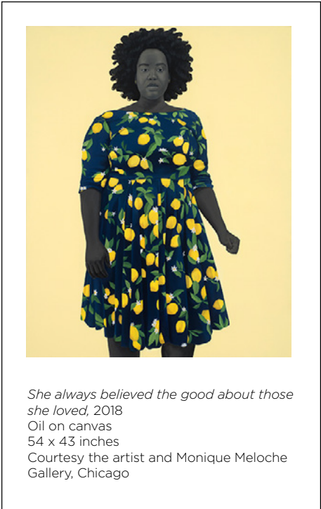
She always believed the good about those she loved, 2018 Oil on canvas 54 x 43 inches Courtesy the artist and Monique Meloche Gallery, Chicago